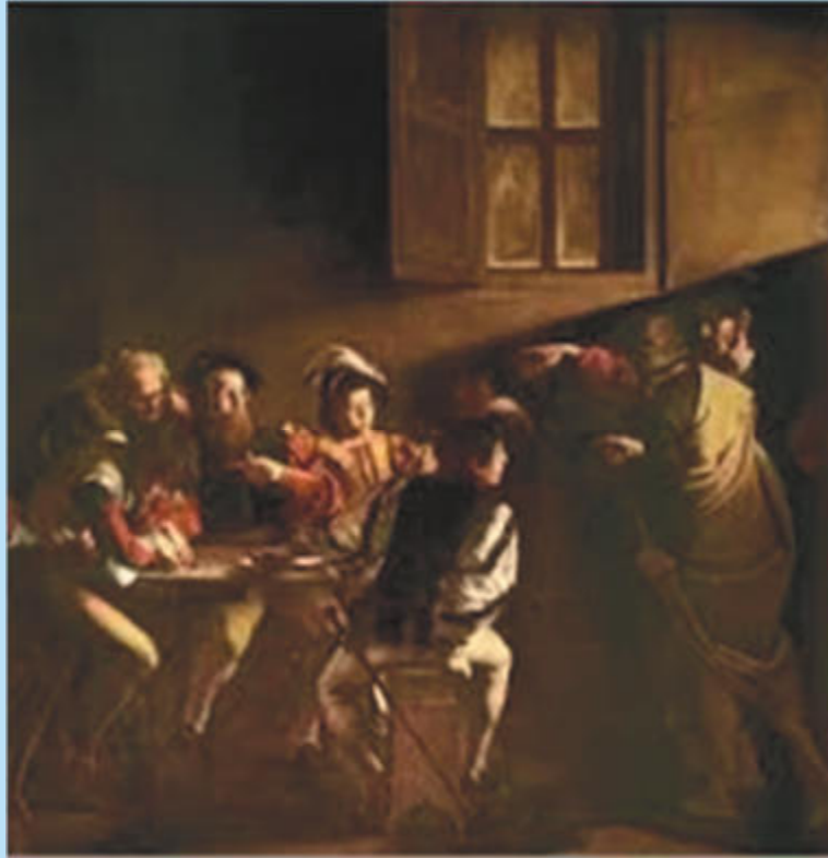
The Feast of Saint Matthew

A Catholic community that is a visible expression of God's love