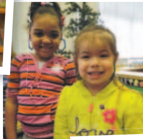
There are two preschool rooms for 34 students. Families can register their child for full or half days, 3-5 days per week.