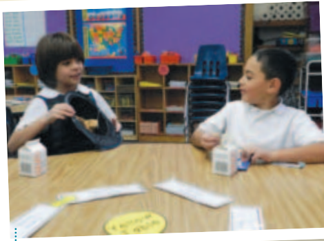
Just like at St. Matt's, every school day starts with breakfast, which reduces tardiness and ensures all students are ready to learn.