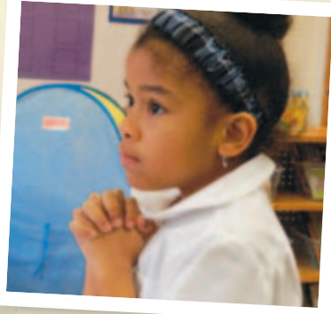
After breakfast, all students stand for the morning prayer and pledge of allegiance, led by middle school students over the loudspeaker.