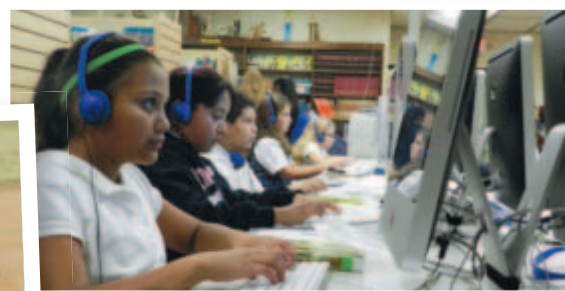
5th grade students work in the computer lab which includes 24 large screen iMacs.